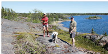
CITY OF YELLOWKNIFE