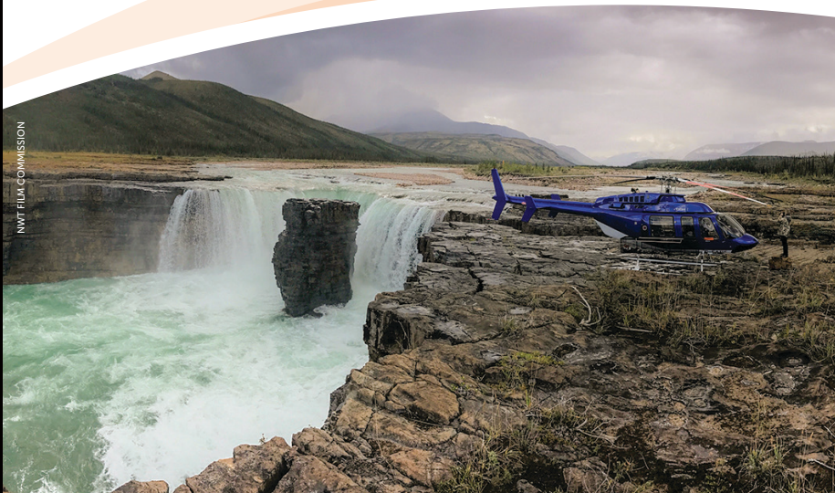
NWT FILM COMMISSION